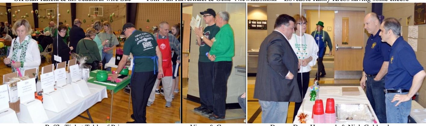
Raffle Ticket Table of Prizes