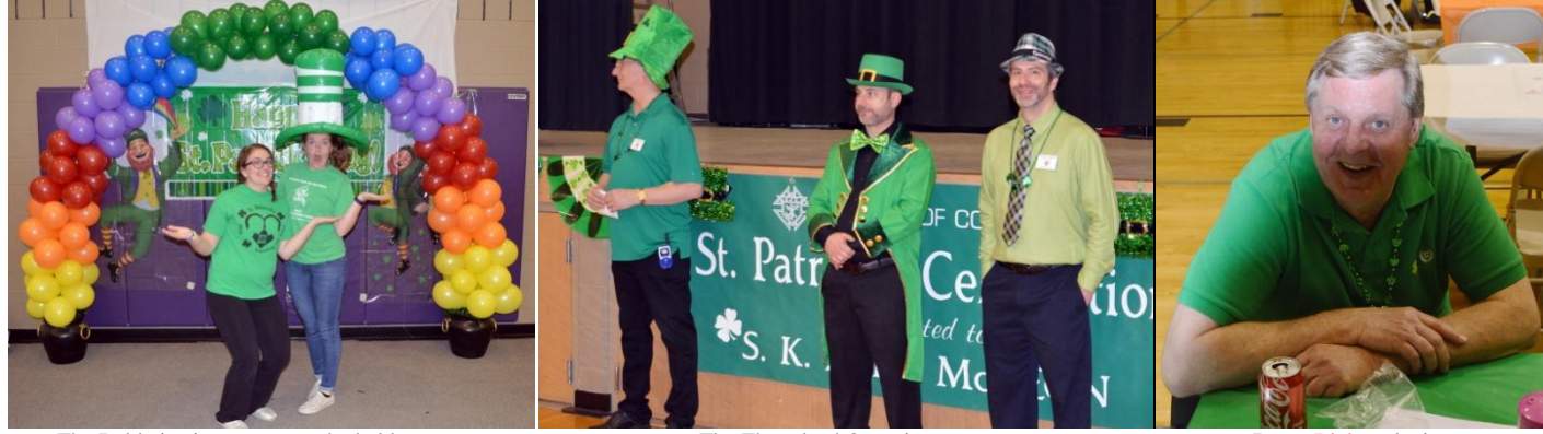
The Baldwin sisters, soon to be bald