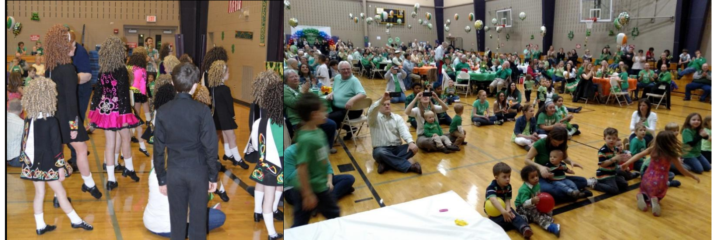
The Trinity Dancers showing us up close & personal how to dance