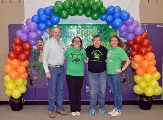
The Baldwin Family (Girls with Hair)