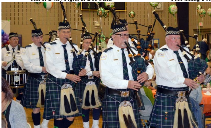
Bagpipes & drums playing as they march in