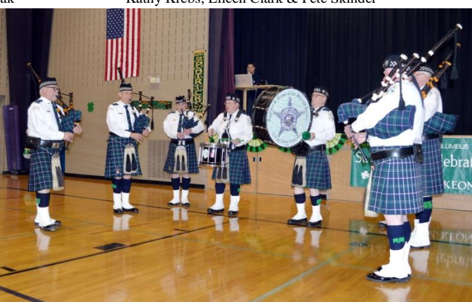
The Bagpipes & Drums of the Emerald Society