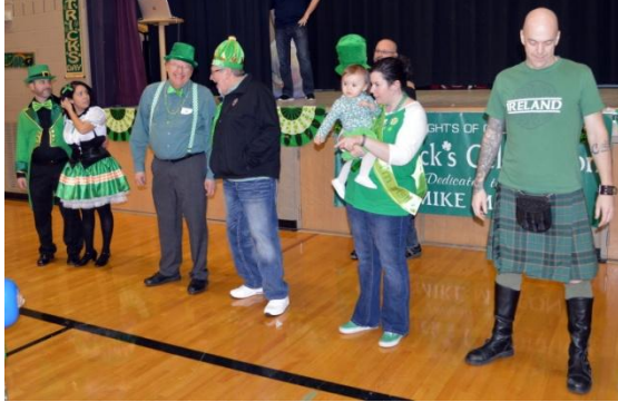
Finalists in Best Dressed Adults